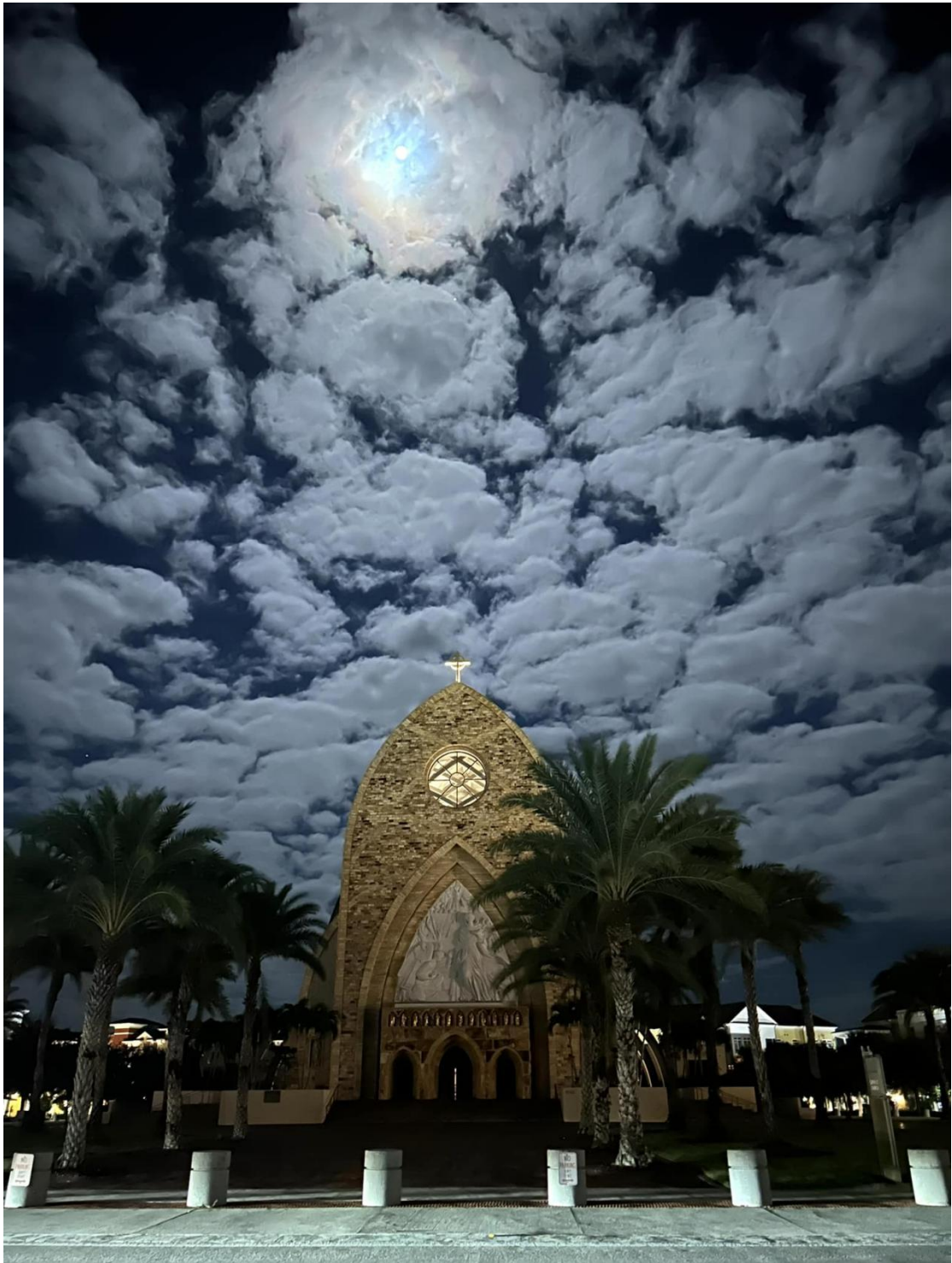
Ave Maria Parish, FL